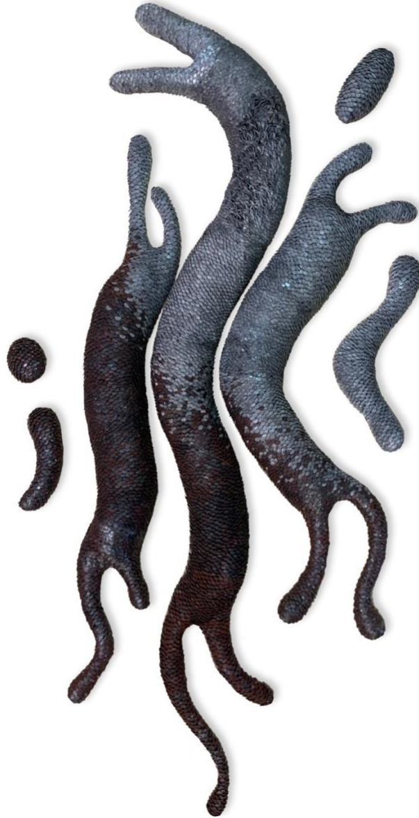
Juliette Frescaline "Régénérescence" Iron wire and recycled metal plaques 98.5" x 39" x 5"

In Frescaline's work "Régénérescence," finely chiseled metallic pieces turn into scales clustered together in voluptuous curves, seemingly inspired by a snake. The same metal that was once used to shape soldiers' armor now calls to mind the shell of an animal protector. This animal mimicry reminds of that the source of our strength is our belonging to the power of the natural cycle. The fire Frescaline wields to create her metal sculptures isn't an instrument that demonstrates humanity's domination over nature. Instead, fire from the natural world is what allows Frescaline to create.