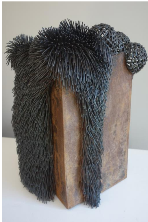
Juliette Frescaline “Reconquête” Iron wire and recycled metal plaques 13.8” x 10” x 9.8”

TINT is pleased to announce “Unforgotten,” featuring works by Juliette Frescaline and Cécilia Lusven. Both artists transform the discarded into something celebrated. Frescaline focuses on the often-overlooked material of iron wire in her metal sculptures. She combines this with the subject matter of wild weeds and animal skins to celebrate the ordinary beauty in the natural world. Similarly, Lusven uses discarded materials such as inner tubes and scraps of leather to reveal the inherent beauty and value in them, while also challenging the trivialization of the textile practice brought on by industrialization. Lusven thus elevates the art of textile from the forgotten to the revered.