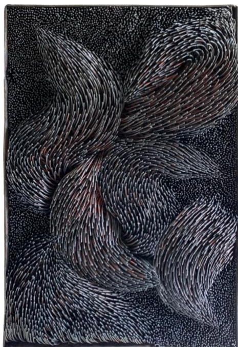
Juliette Frescaline “Murmure du Vent V” Iron wire and recycled metal plaques 15.8” x 10.2” x 4.3”

Opening Reception: May 11, 2024 5:30 pm - 7:30 pm