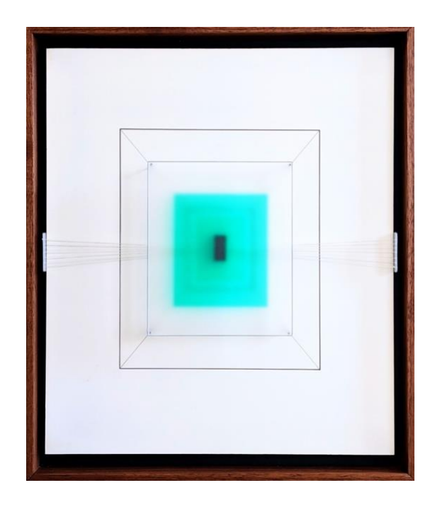
Ramiro Cairo "Tension and Hope" Pen, wire, thread, tinted polycarbonate, and plexiglass on plywood with kaolin clay

5:30 pm - 7:30 pm with artist tour at 6:30 pm