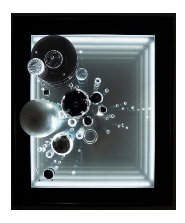
Minami Oya "Infinity No.3: Traverse Black" Glass, mirror, LED light, paint