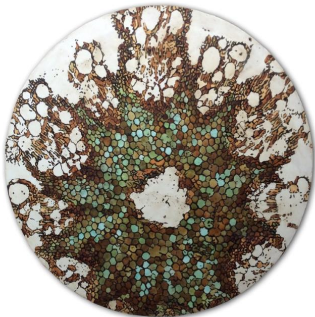
Vero Reato "Organik" Ivory concrete, oxides

Opening Reception: February 25, 2023 5:00 pm - 7:00 pm