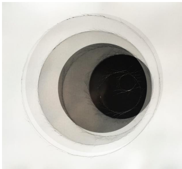
Betsy Kenyon "Orbit Inner" Unique gelatin silver print

Opening Reception: June 15, 2023 6:00 pm - 8:00 pm with artist tour at 6:45pm