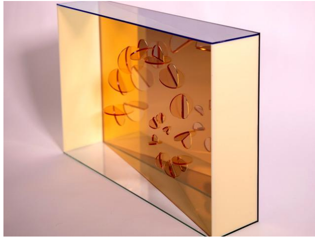
Blanca Estela Rodríguez "Natura" Colored acrylic glass, mirror

In luminous acrylic glass works, Rodríguez creates metaphorical spaces that reductively explore the illusion of a stable reality. Despite static architectural shapes and lines, that which is solid seems to dissolve and the viewer's experience is never quite the same depending on the atmospheric elements. Shapes appear to bend as reflections confuse boundaries, and shadows complicate the core structures of each sculpture.