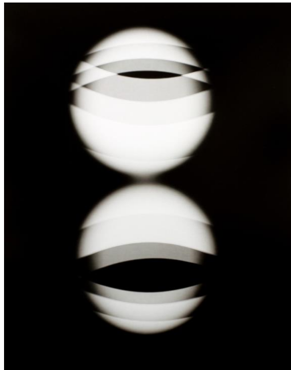
Betsy Kenyon “Separating” Unique gelatin silver print

Kenyon’s work is a merging of different processes; it challenges distinctions between 2-dimensional and 3-dimensional experiences, capturing normally imperceptible time events. Using darkroom techniques as her medium, Kenyon blurs established lines between drawing, painting, photography, and sculpture. Each darkroom print is one of a kind, made without a negative. Each part of the image is a unique, split-second exposure/gesture where incremental advances become differences in tonal value and ultimately differences in a perceived visual space. Even though Kenyon’s works are produced chemically in a darkroom, Kenyon refers to them as “darkroom drawings” because they feel less photographic and more drawing-like to her.